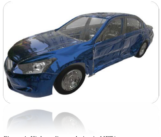
Figure 4: High quality rendering in META

The requirement of engineering software, particularly for an immersive CAE simulation results' visualization, led BETA CAE Systems to develop the support of the HTC VIVE and Oculus Rift virtual reality headsets from META, its multi-disciplinary CAE simulation post-processing software. Multi-disciplinary implies that META natively supports and is able to read a wide array of CAE files from different types of analyses (crash, durability, NVH, CFD) and solvers, including LS-DYNA. META is highly optimized for results' extraction and reporting through automation and, coupled with high quality graphics and advanced rendering capabilities using PBR (physically based rendering) materials and HDR (High Dynamic Range) environment images, can present supported simulation results in a very realistic manner.