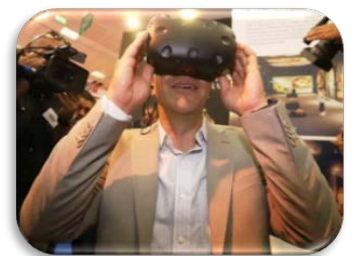
Figure 2: HTC VIVE headset

Recent developments in increasing display quality by reducing pixel size have led to the development of HMD (head-mounted display) hardware that brings virtual reality inches or centimeters from our eyes. In the past year two such devices have prevailed from the many that were or are being developed: the HTC VIVE and the Oculus Rift. The visualization quality of this generation of devices does not yet match that of CAVE but their portability, hardware requirements and relatively low pricing have made them accessible to a large audience, mainly for gaming purposes, but also to a growing number of scientific and engineering uses.