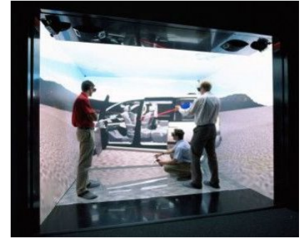
Figure 1: CAVE room

Upon its release this immersive solution provided unique opportunities for room-scale photorealistic visualization of computer models and helped prove the feasibility and usefulness of the VR concept. Throughout the following years and still today, the CAVE system is the standard for such visualization applications and, coupled with task-specific software, was successfully integrated in product life management, from design phase to manufacturing. Automotive companies in particular invested in such facilities, utilizing them for design phases ranging from ergonomics, to detailing/selection of interior materials and even to manufacturing.